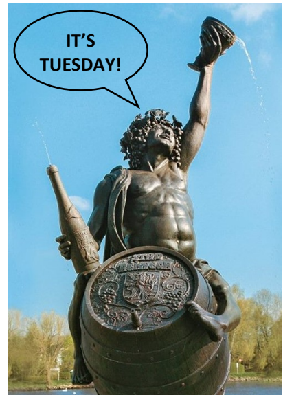
Statue of Dionysus in Remich Luxembourg

Bacchus was the Roman god of agriculture, wine and fertility copied from the Greek god Dionysus . He was the last god to join the twelve Olympians. His plants were vines and twirling ivy.